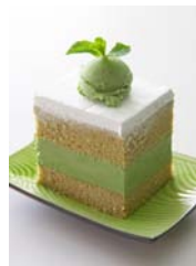
Our Famous Green Tea Ice Cream Cake

Recognized by Yelp and Lucky Magazine as a great place for food, drinks, sushi, and desserts!