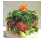
Spicy Tuna Tower