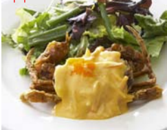
Soft Shell Crab Appetizer